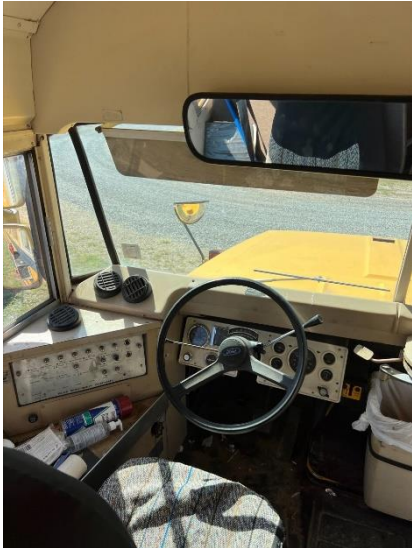
94 Ford Bus